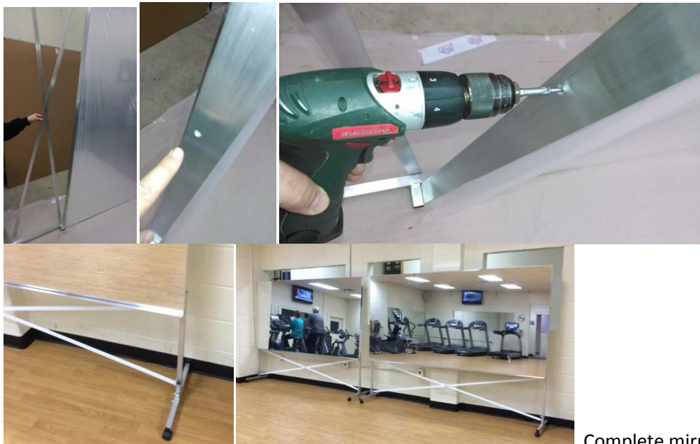
Complete mirrors. 5/2014gr

Do not over tighten or strip. Set clutch on drill half the full strength setting.